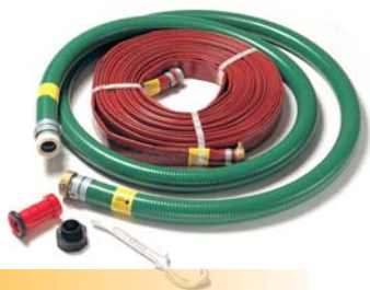
High Pressure Hose Kit 55-338

Use for fire protection or irrigation. Available with a wide choice of standard and heavy duty gasoline and diesel fueled engines. Unit is standard with die-cast aluminum housing and cast-iron impeller. All Models standard with EPDM elastomers and seals. Many models are readily available "Off-the Shelf" for fast 24 hour shipment. For use with non-flammable liquids which are compatible with pump component materials.