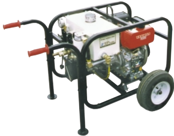
Unit Shown with Optional Wheel Kit

This portable diesel power pack is ideal for driving our 2" pumps and slim-line borehole pump. It also can provide hydraulic power to run many other hydraulic tools . Two models are available with flows of 3 GPM @ 2500 PSI or 4.5 GPM @ 1800 PSI.