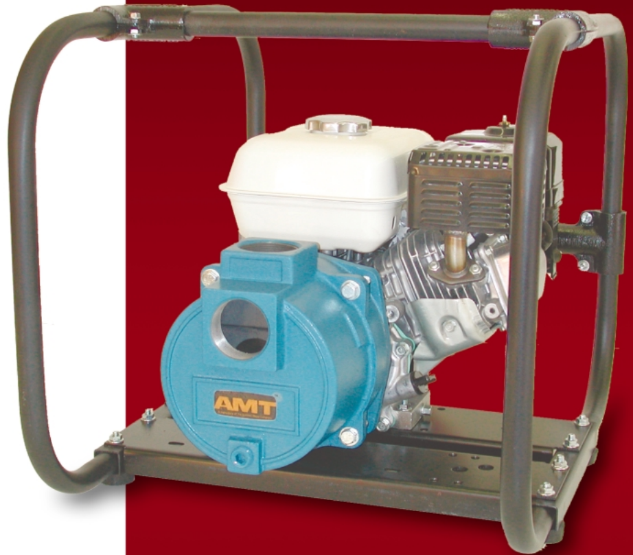
316F-95 Dredging Pump

AMT Dredging pumps are reliable, cost effective and low maintenance. For use with non-flammable liquids compatible with pump component materials.